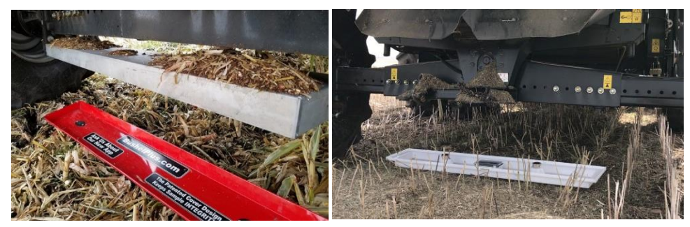
Figure 3. Bushel Plus drop pan (left; image source: <u>http://bushelplus.ca/bushel-plus-harvest-loss-system/</u>) Schergain drop pan (right; image source: <u>https://www.schergain.ca/pricing/</u>).

The Bushel Plus drop pan comprised a cover that was directly attached to the combine and a drop pan that is secured to the cover with magnets. This drop pan has interior dimensions of 10.0 in (25.4 cm) by 59.3 in (150.6 cm), with a catch area of 4.11 ft<sup>2</sup> (0.38 m<sup>2</sup>). The Schergain drop pan attaches directly to the combine. This drop pan has interior dimensions of 11.5 in (29.2 cm) by 66.0 in (167.6 cm), with a catch area of 5.27 ft<sup>2</sup> (0.49 m<sup>2</sup>). Both drop pans are equipped with remote controls that allow the drop pan to be released at the optimum time during combine loss testing.